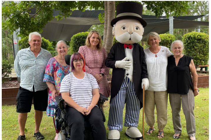
Mr Monopoly was introduced to Bravo's Board Members at Strategic Planning Event.

The Board and Management Team met for the first time in Gympie to achieve a successful Strategic Planning Event. This Event was held at the Gympie UniSC on the 5 - 7 March, 24 and the Board will make available the 2024 - 2027 Strategic Plan as soon as it is finalised.