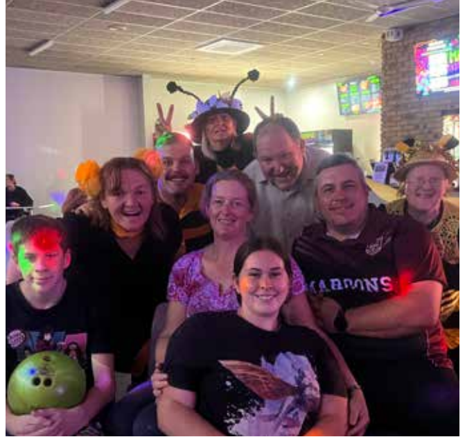
Congratulations to all the winners of the best-dressed and door prizes.

A special thanks to Valley Gold Honey for providing the honey used in the lucky door prizes. Gympie Tenpin Bowling & Entertainment offered excellent facilities for the event. Bravo looks forward to more successful bowling nights in the future.